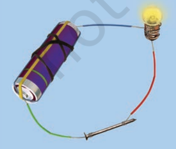
Fig. 4.2: Electric tester

Recall how to make an electric circuit to test whether electricity can pass through an object or not (Fig. 4.2). You might have performed