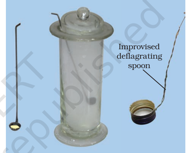
Fig. 4.4 (a): Burning of sulphur powder

As soon as sulphur starts burning, introduce the spoon into a gas jar/glass tumbler [Fig. 4.4 (a)]. Cover the tumbler with a lid to ensure that the gas produced does not escape. Remove the spoon after some time. Add a small quantity of water into the tumbler and quickly replace the lid. Shake the tumbler well. Check the solution with red and blue litmus papers [Fig. 4.4 (b)].