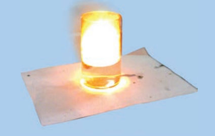
Fig. 4.5: Reaction of sodium with water

Take a 250 mL beaker/glass tumbler. Fill half of it with water. Now carefully cut a small piece of sodium metal. Dry it using filter paper and wrap it in a small piece of cotton. Put the sodium piece wrapped in cotton into the beaker. Observe carefully. (During observation keep away from the beaker). When reaction stops touch the beaker. What do you feel? Has the beaker become hot? Test the solution with red and blue litmus papers. Is the solution acidic or basic?