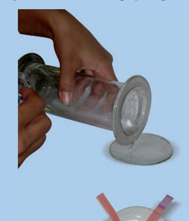
Fig. 4.4 (b): Testing of solution with litmus papers