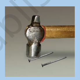
Fig. 4.1: Beating an iron nail with hammer the aluminium wire also. Then repeat the same kind of treatment on the coal piece and pencil lead. Record your observations in Table 4.2.

Take a small iron nail, a coal piece, a piece of thick aluminium wire and a pencil lead. Beat the iron nail with a hammer (Fig. 4.1). (But take care that you don't hurt yourself in the process.) Try to hit hard. Hit hard