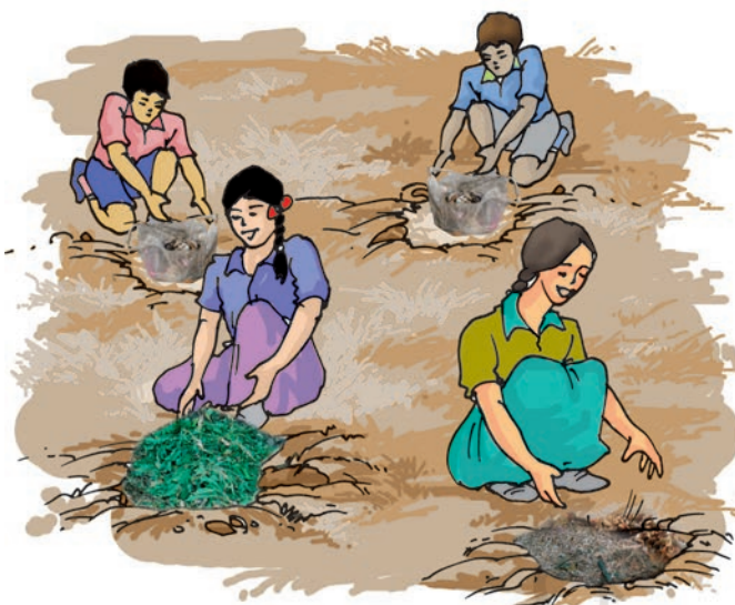
Fig. 16.2 Putting garbage heaps in pits

Now divide the contents of each group into two separate heaps. Label them