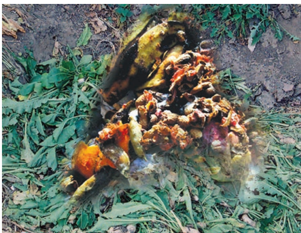
Fig. 16.5 Food for redworms

that may contain salt, pickles, oil, vinegar, meat and milk preparations as food for your redworms. If you put these things in the pit, disease-causing small organisms start growing in the pit. Once in a few days, gently mix and move the top layers of your pit.