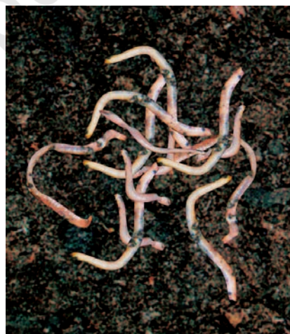
Fig. 16.4 Redworms

Now, your pit is ready to welcome the redworms. Buy some redworms and put them in your pit (Fig. 16.4). Cover them loosely with a gunny bag or an old sheet of cloth or a layer of grass.