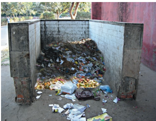
Fig. 16.7 Neighbourhood garbage dump

a few days. In how many days does the bucket become full? You know the number of members in your family. If you find out the population of your city or town, can you now estimate the number of buckets of garbage that may be generated in a day in your city or town? We are generating mountains of garbage everyday, isn't it (Fig. 16.7)?