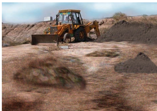
Fig. 16.1 A landfill

There the part of the garbage that can be reused is separated out from the one that cannot be used as such. Thus,