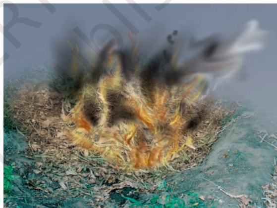
Fig. 16.3 Burning of leaves produce harmful gases

crop plants in their fields after harvesting. Burning of these, produces smoke and gases that are harmful to our health. We should try to stop such practices. These wastes could be converted into useful compost.