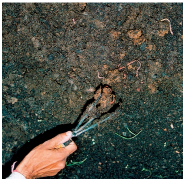
Fig. 16.6 Vermicomposting

Put some wastes as food in one corner of the pit. Most of the worms will shift