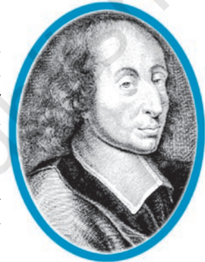
Blaise Pascal (1623-1662)

In earlier classes, we have learnt how to find the squares and cubes of binomials like a + b and a - b . Using them, we could evaluate the numerical values of numbers like (98)^2 = (100 - 2)^2 , (999)^3 = (1000 - 1)^3 , etc. However, for higher powers like (98)^5 , (101)^6 , etc., the calculations become difficult by using repeated multiplication. This difficulty was overcome by a theorem known as binomial theorem. It gives an easier way to expand (a + b)^n , where n is an integer or a rational number. In this Chapter, we study binomial theorem for positive integral indices only.