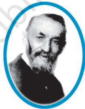
G. Peano (1858-1932)

In contrast to deduction, inductive reasoning depends on working with each case, and developing a conjecture by observing incidences till we have observed each and every case. It is frequently used in mathematics and is a key aspect of scientific reasoning, where collecting and analysing data is the norm. Thus, in simple language, we can say the word induction means the generalisation from particular cases or facts.